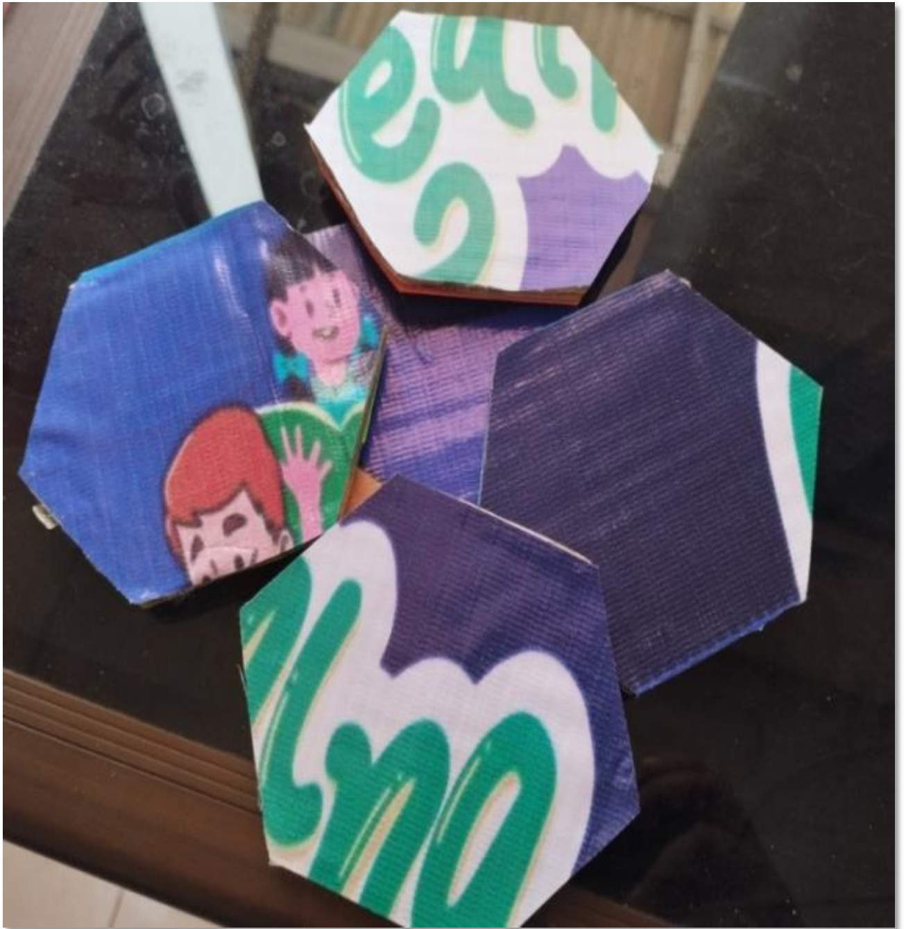
Figure 3. The look of the puzzle pieces.