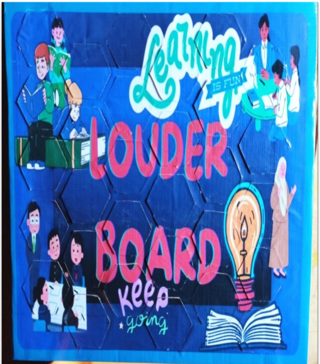
Figure 1. The Look of Louder Board Game.