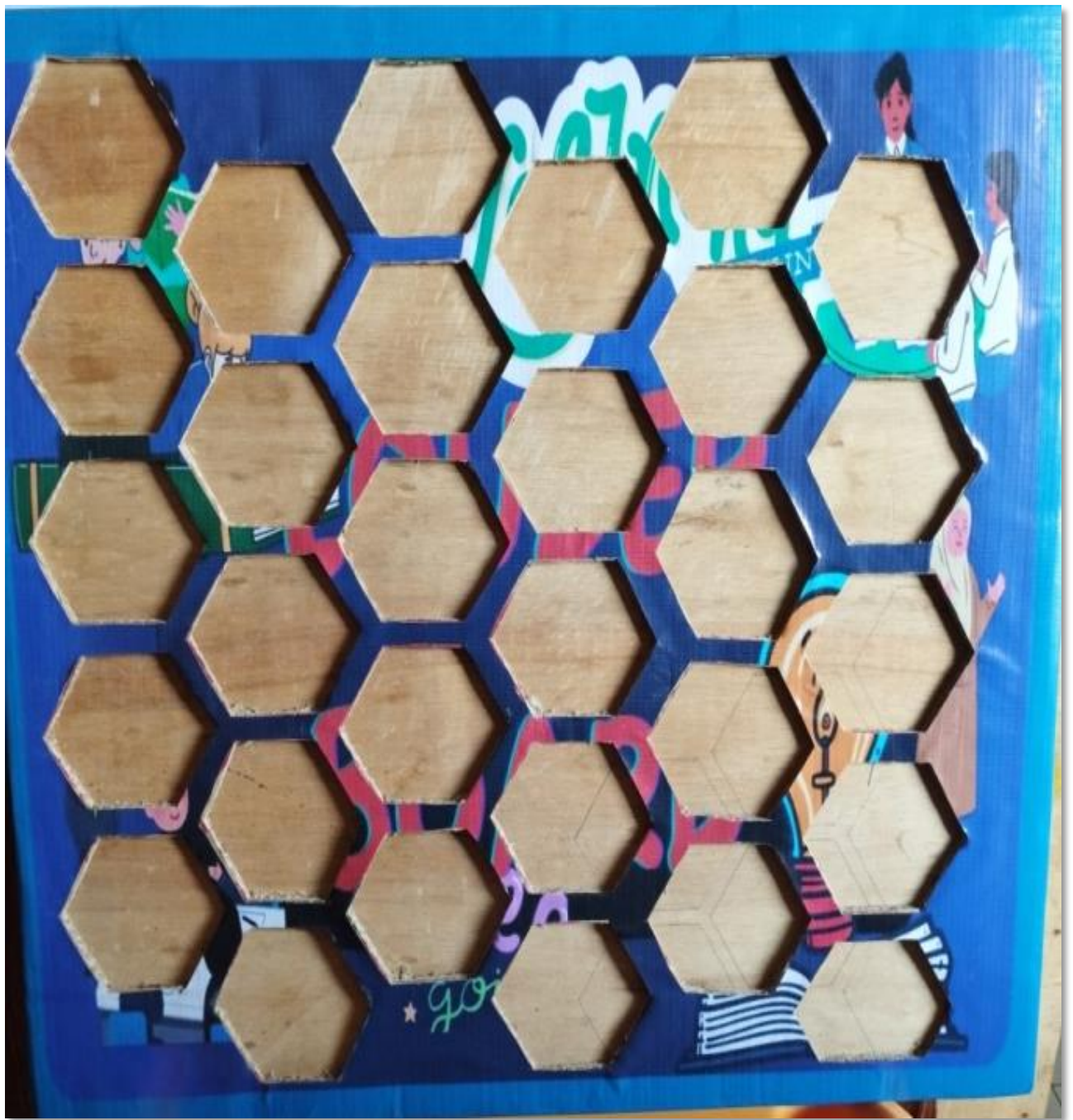
Figure 2. The appearance of the Louder Board game board without the puzzle pieces.