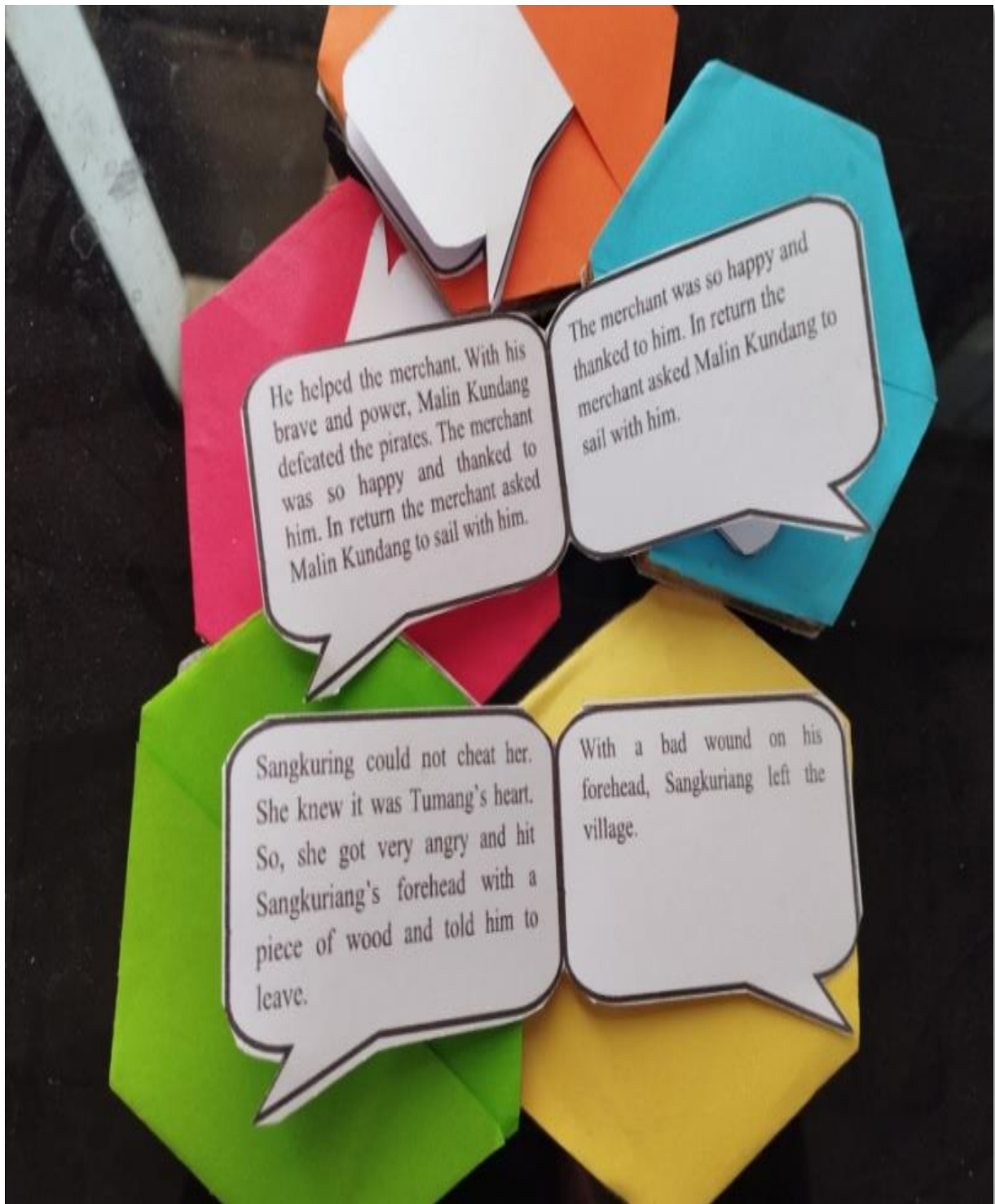
Figure 4. The look of Story Card