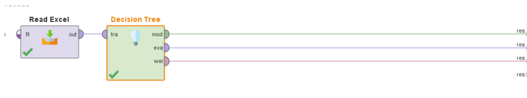
Figure 1. Decision tree relationship