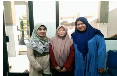
Gambar 10. Penutupan Kegiatan Penelitian