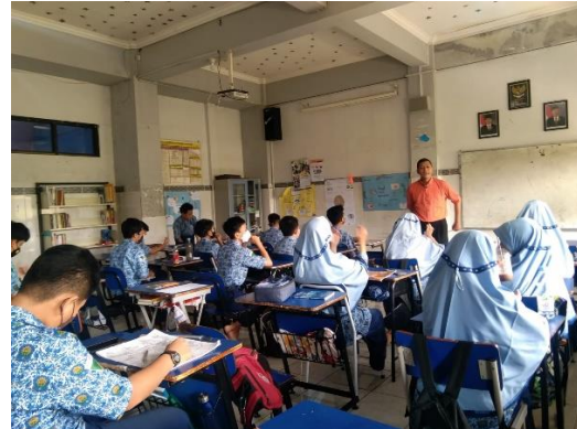
Gambar 2. Kegiatan Pre Observasi di kelas ESL 8 ICP 2