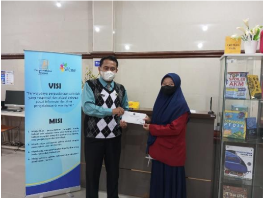
Gambar 1. Memberikan Surat Permohonan Izin Penelitian