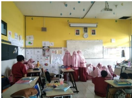
Gambar 6. Observasi hari ketiga di kelas ESL 7 ICP 1