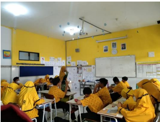
Gambar 3. Kegiatan Pre Observasi di kelas 7 ICP 1