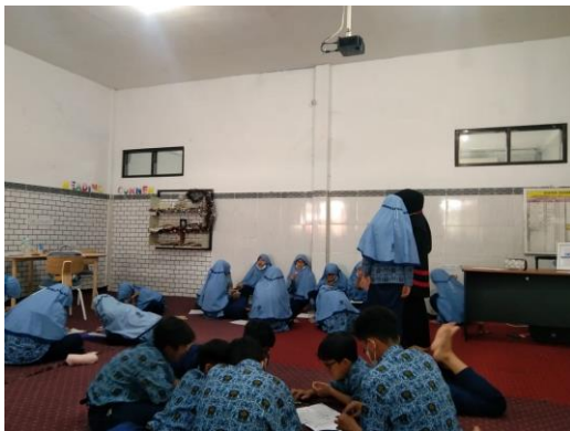
Gambar 5. Observasi hari kedua di kelas ESL 7 ICP 1