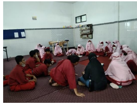
Gambar 4. Observasi hari pertama di kelas ESL 7 ICP 1