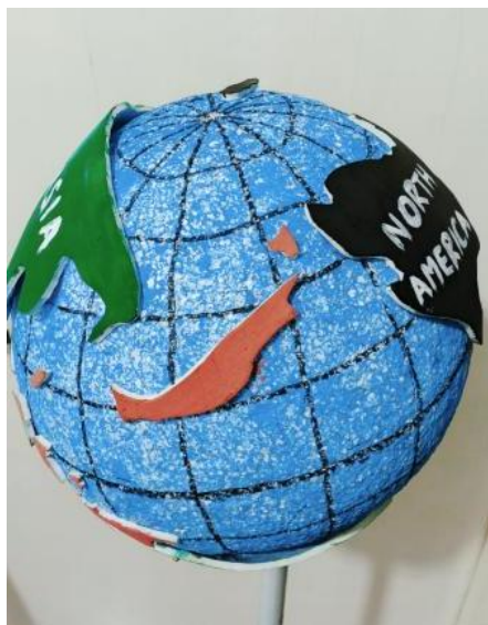
Gambar 4 Australia