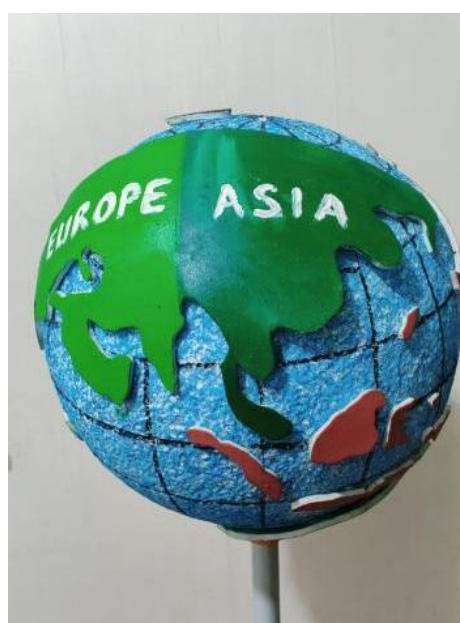
Gambar 3 Europe & Asia