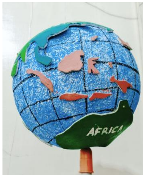
Gambar 5 Africa