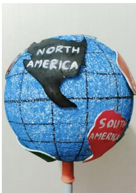
Gambar 2 North America