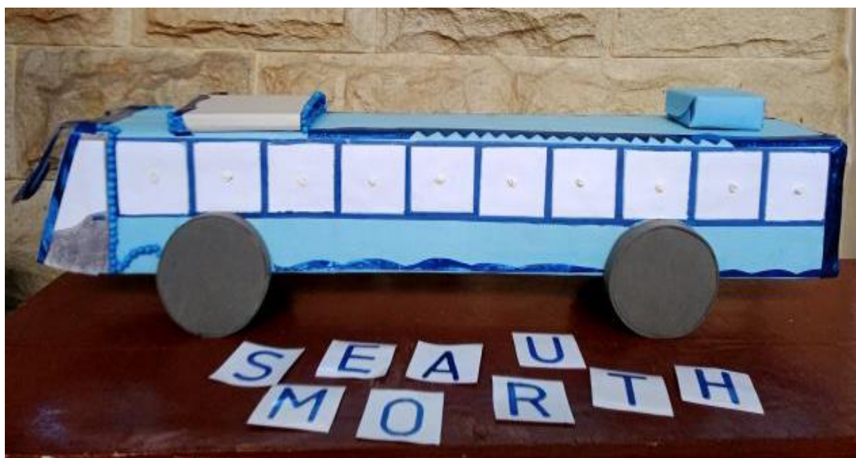
Figure 1. View the letters are arranged randomly