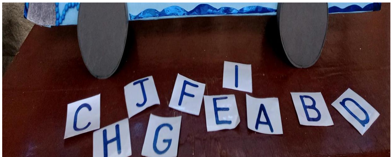
Figure 5. View of the shuffle letters