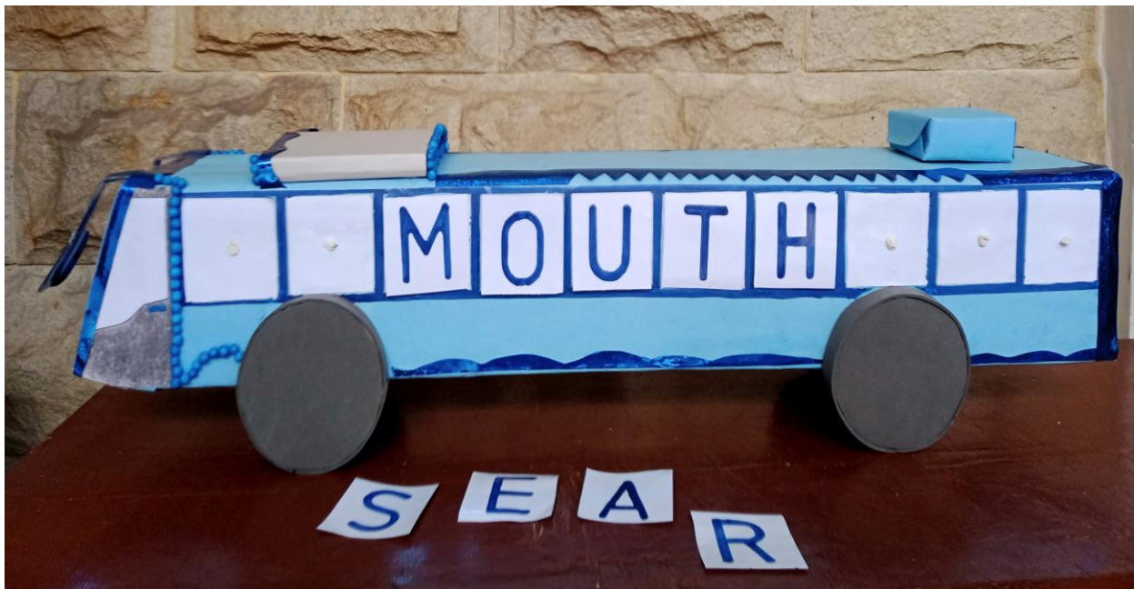
Figure 2. View words in correct order