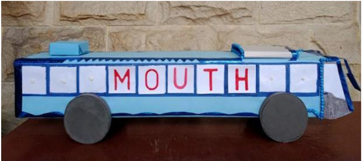
Figure 4. Right Side View