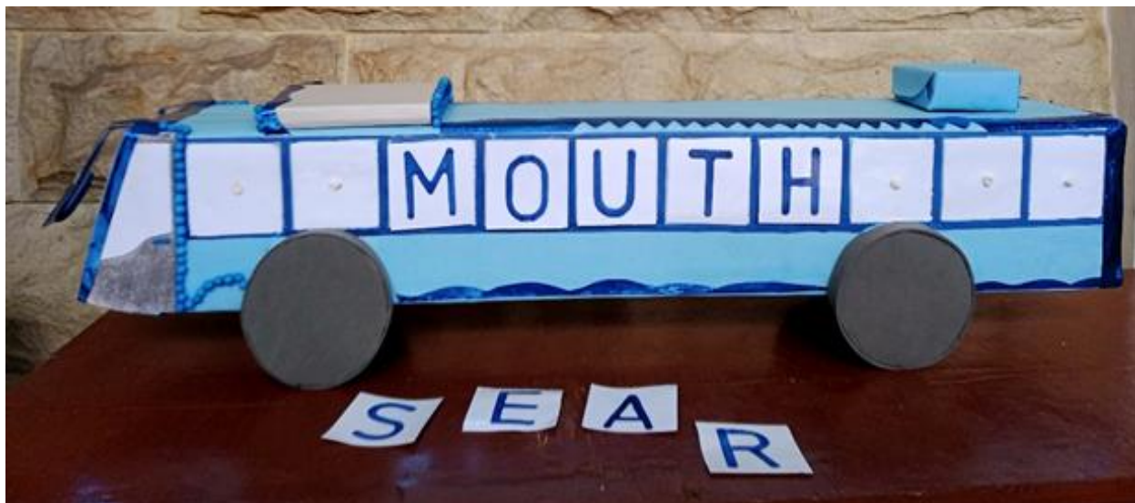
Figure 3. Left Side View