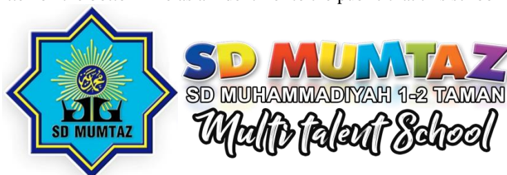
Fig.1 Logo with the words multi talent school

The logo, as a form of brand blueprint, has been set by the research institute that reflects the determination as a place to guide children's talents. The logo that reads multitalent school is introduced through advertisements in various mass media, ranging from print, electronic, pamphlets, billboards and other mass media, especially mass media that can be trusted and can reach all levels. Indeed, social media can be an effective means of introducing branding.[15]. The logo is posted on the school's webpage on social media, but is not yet available in physical form at the school. The logo has also not been provided in a large and conspicuous form, for example for photo spots that can be used as photo backgrounds for the millennial generation's favorite. In this context, the logo has not been used as one of the icons that is "splashy" to introduce the school's new brand in the research arena. The logo consists of the words "SD Mumtaz" which are given colors as a symbol that the talents of children who come to the school have diverse and unique talents. The words "multitalent school" are written on the bottom line as an identifier to the public that this school has this characteristic.