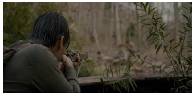
Scene 28, Medium Close Up