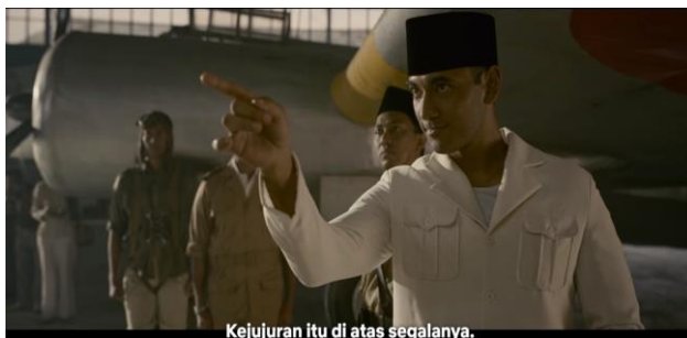
Kejujuran itu di atas segalanya.

The cadets gathered in the field after the Netherlands attack on the feed plane