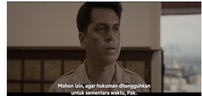
Scene 50, Close Up