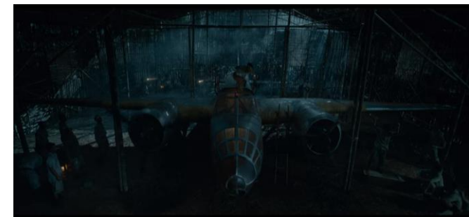
Scene 35, High Angle