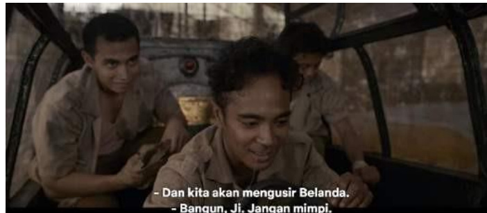
- Dan kita akan mengusir Belanda. - Bangun, Ji. Jangan mimpi.