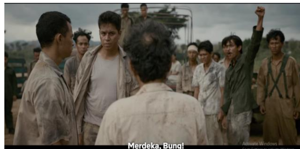
Scene 47, Medium Long Shot