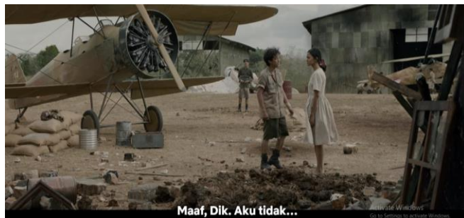
Scene 49, Long Shot