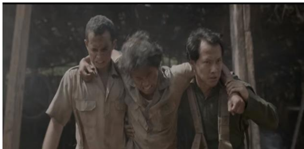
Scene 43, Medium Shot

Using techniques medium shot , medium long shot , close up , long shot , medium close up , high angle , & low angle