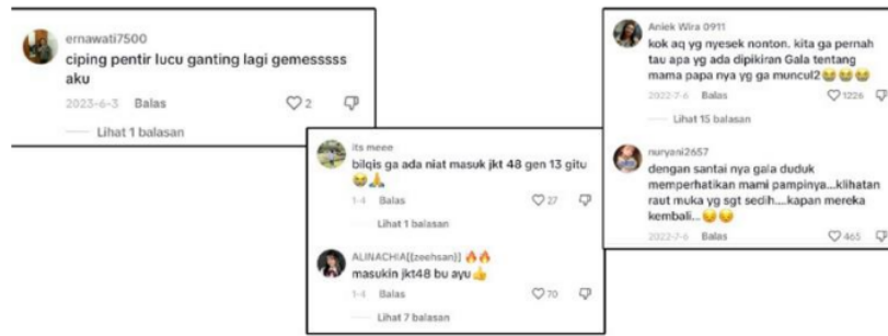
Figure 2. Example Comments in Videos of Cipung, Bilqis, and Gala

Aside from media exposure, the personal characteristics of these celebrity children also play a crucial role in their celebrification process. Attractive personal traits, whether physical appearance, personality, or talent, can significantly enhance their appeal to the public and create an emotional connection between them and the audience. This concept is supported by the theory of Alberoni & McQuail, which emphasizes that emotional involvement with the audience is one of the main factors driving the success of celebrification [26].