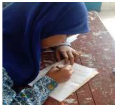
Figure 2 Photo of students taking the post-test