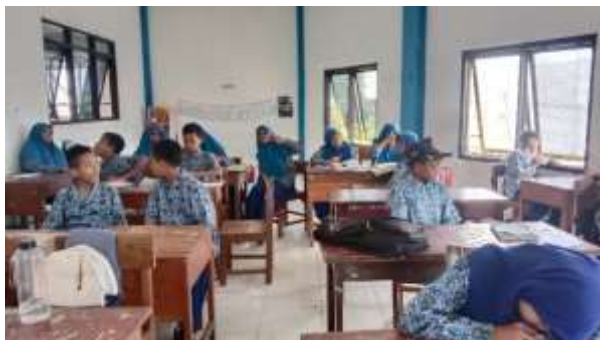
Figure 1 Photo of students taking the pre-test.