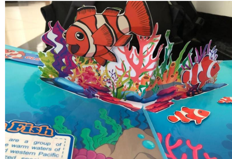
Figure 3. Side View of First Page of the Clownfish