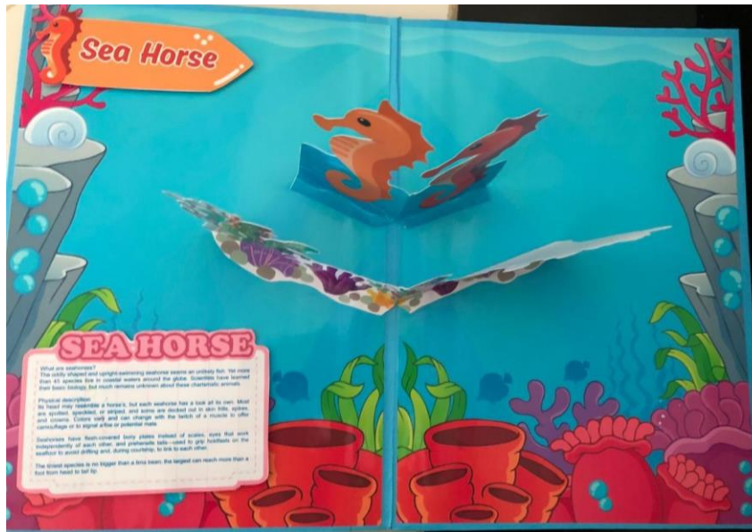
Figure 8. Top View of Fourth Page Description of Seahorse