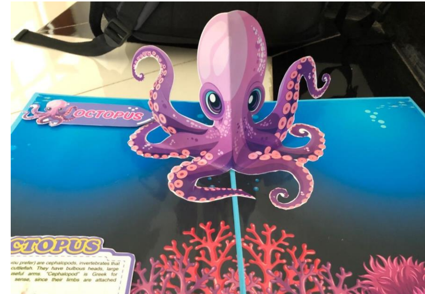
Figure 5. Side View of Second Page of the Octopus