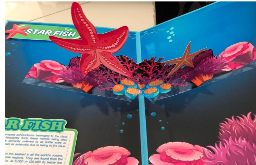
Figure 11. Side View of Fifth Page of the Starfish