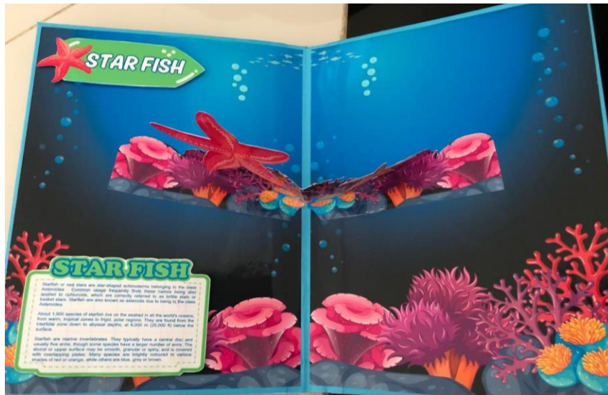
Figure 10. Top View of Fifth Page Description of Starfish