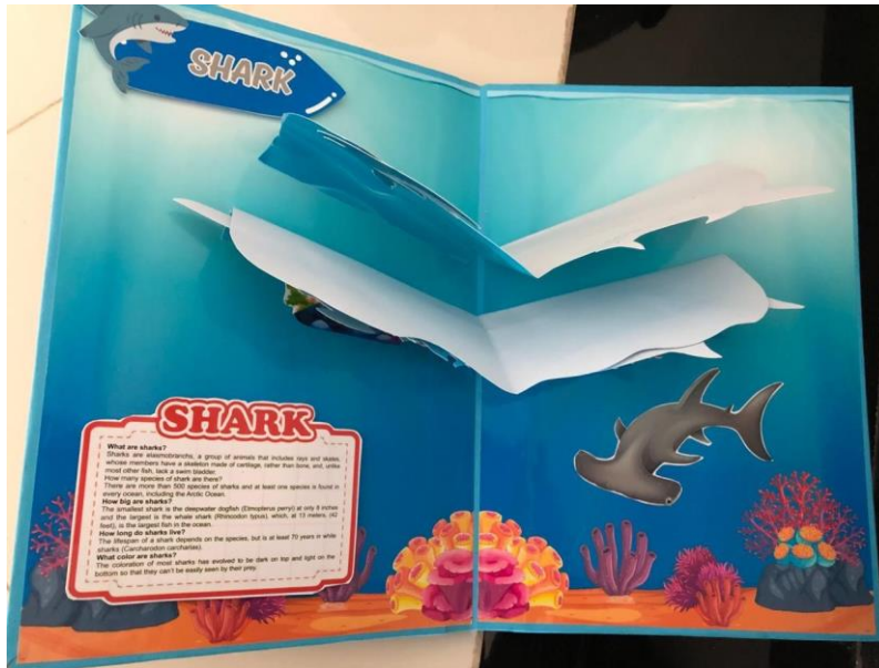
Figure 6. Top View of Third Page Description of Shark