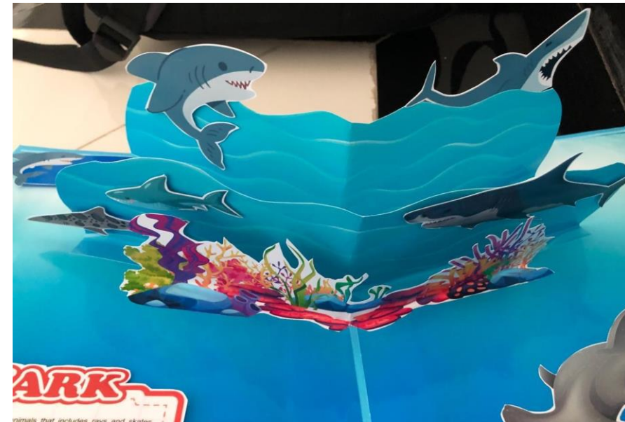
Figure 7. Side View of Third Page of the Shark