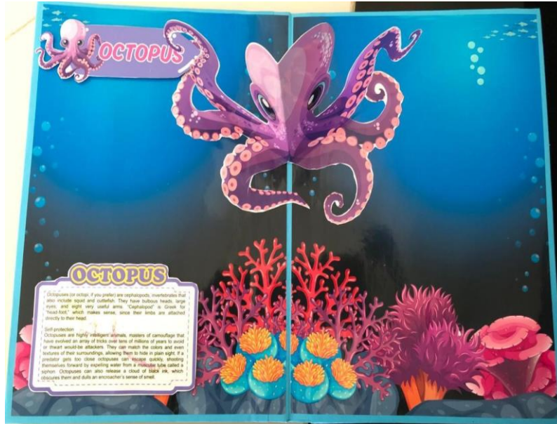
Figure 4. Top View of Second Page Description of Octopus