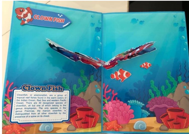
Figure 2. Top View of First Page Description of Clownfish