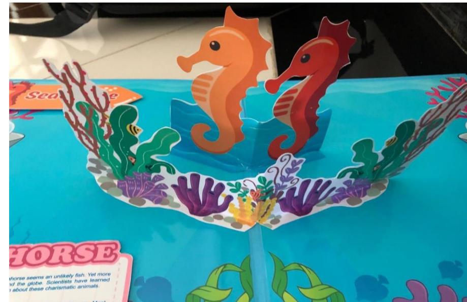
Figure 9. Side View of Fourth Page of the Seahorse