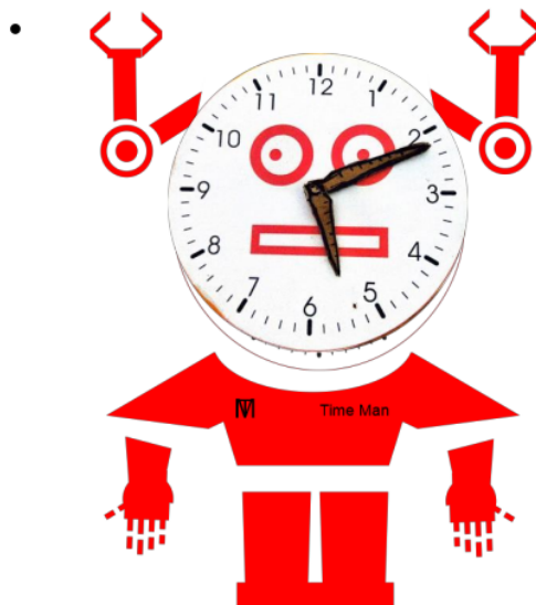
Picture 2. Display Rotateable Clock

The teacher explains the learning material in the picture above, such as 08.00 is 8 o'clock, 08.05 is five past eight, etc