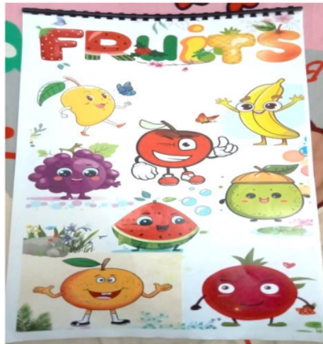
Image 1. Front Cover of Big Book of Fruits