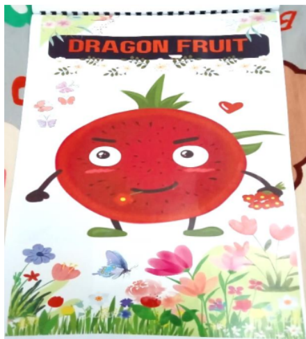
Figure 12. The Visuals on Page 12 "DRAGON FRUIT"