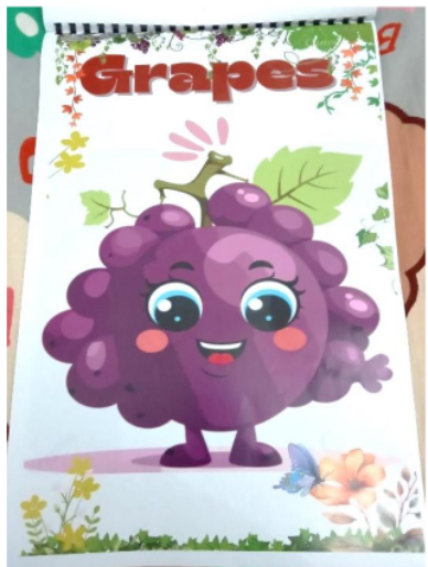
Figure 6. The Visuals on Page 6 "GRAPES"