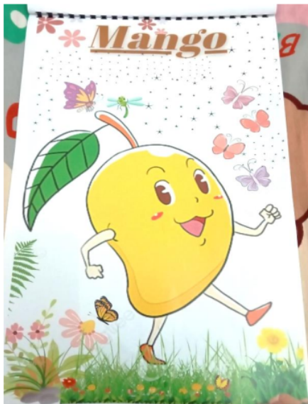
Figure 10. The Visuals on Page 10 "MANGO"