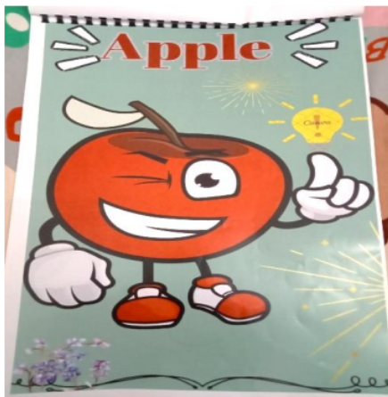
Figure 2. The Visuals on Page 2 "APPLE"