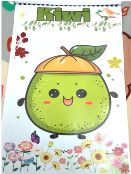
Figure 16. The Visuals on Page 16 "KIWI"