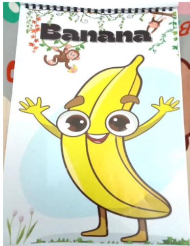
Figure 4. The Visuals on Page 4 "BANANA"