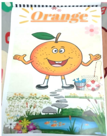
Figure 14. The Visuals on Page 14 "ORANGE"