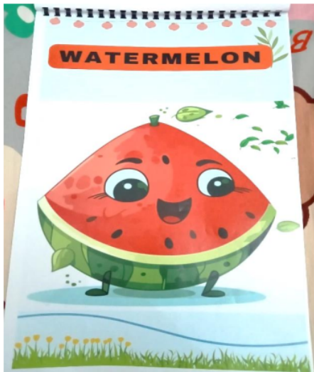
Figure 8. The Visuals on Page 8 "WATERMELON"