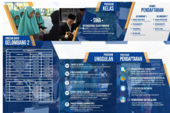
Figure 2. Promotional Brochure of Al Fattah Buduran Sidoarjo Islamic Boarding School