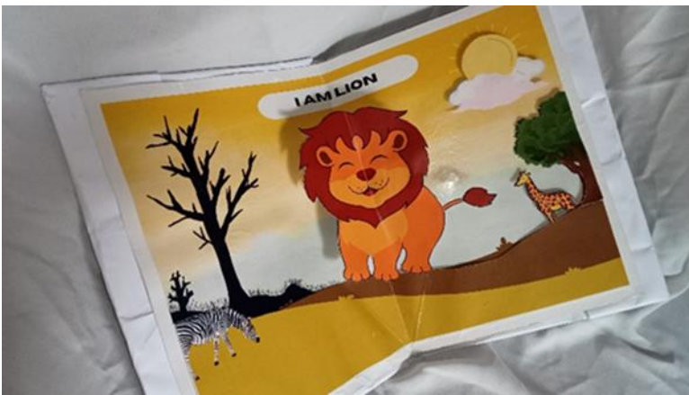
Figure 2. The Display of Page 1 "LION"