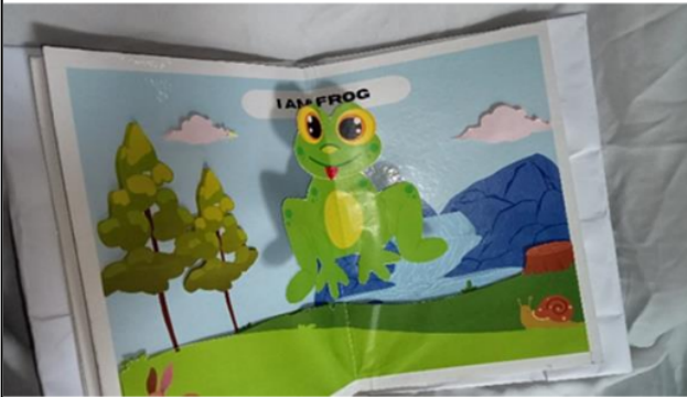
Figure 8. The Display of Page 4 "FROG"