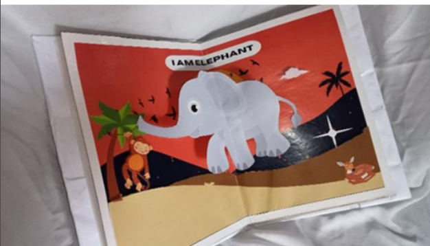
Figure 4. The Display of Page 2 "ELEPHANT"