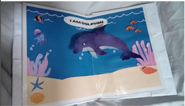
Figure 10. The Display of Page 5 "DOLPHIN"