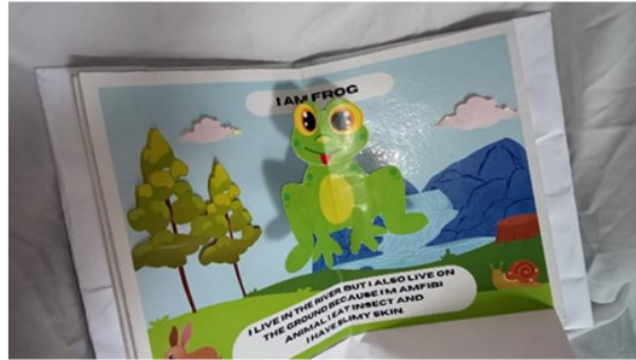
Figure 9. The Description Text of "FROG"