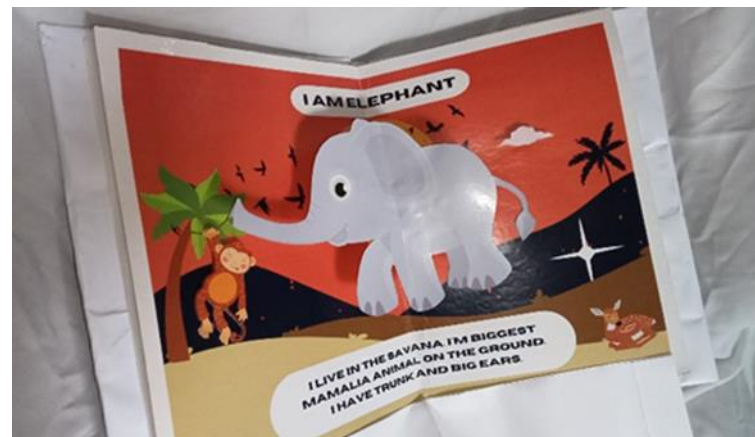
Figure 5. The Description Text of "ELEPHANT"