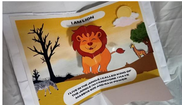
Figure 3. The Description Text of "LION"