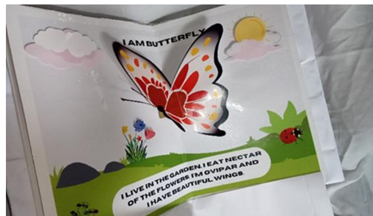
Figure 7. The Description Text of "BUTTERFLY"