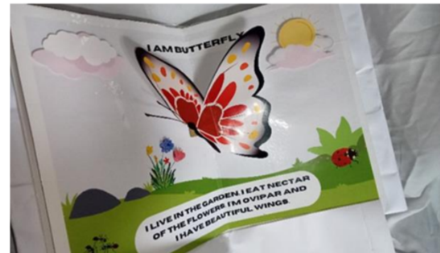
Figure 7. The Description Text of "BUTTERFLY"