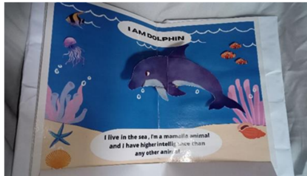
Figure 11. The Description Text of "DOLPHIN"