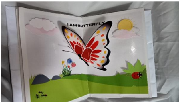
Figure 6. The Display of Page 3 "BUTTERFLY"