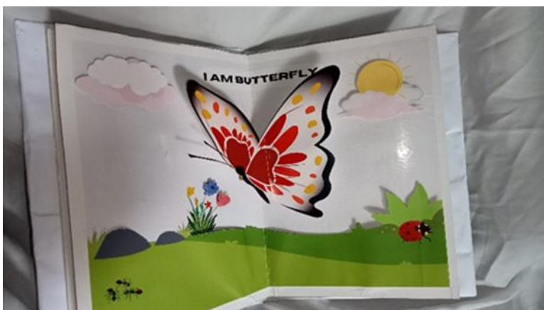
Figure 6. The Display of Page 3 "BUTTERFLY"