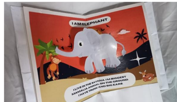
Figure 5. The Description Text of "ELEPHANT"