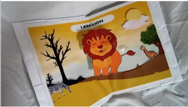
Figure 2. The Display of Page 1 "LION"