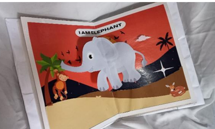
Figure 4. The Display of Page 2 "ELEPHANT"