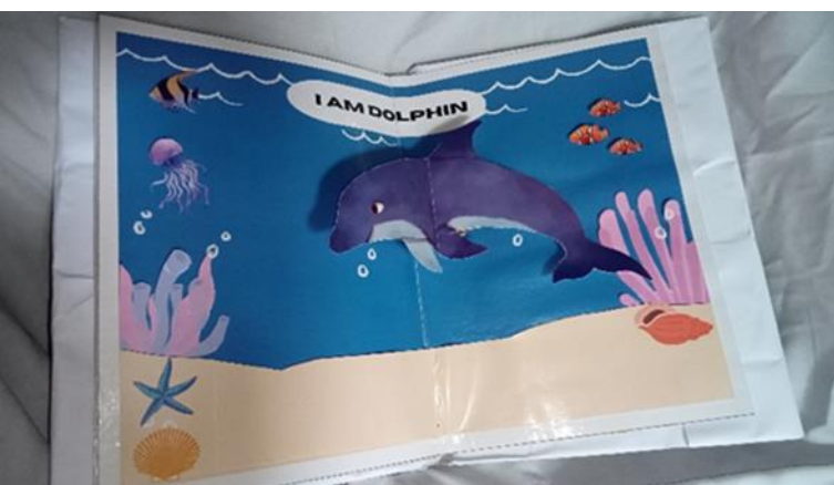
Figure 10. The Display of Page 5 “DOLPHIN”