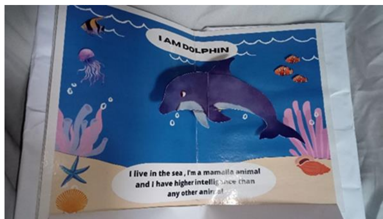
Figure 11. The Description Text of “DOLPHIN”