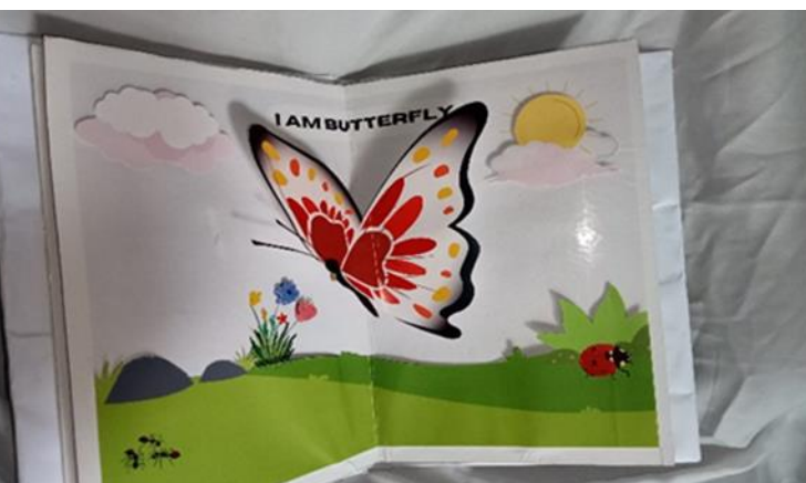
Figure 6. The Display of Page 3 "BUTTERFLY"