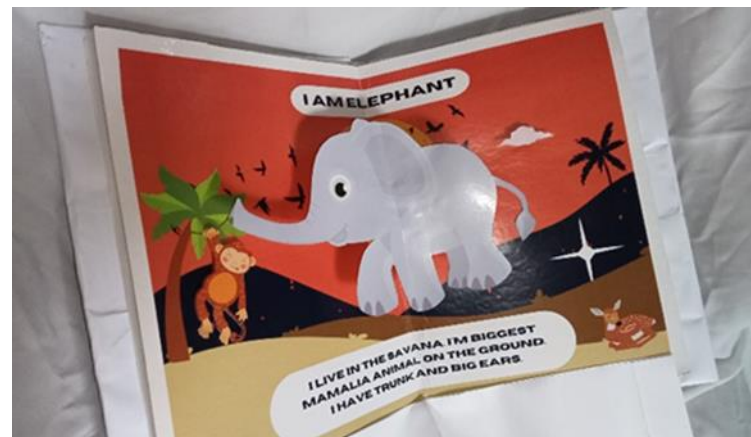
Figure 5. The Description Text of "ELEPHANT"