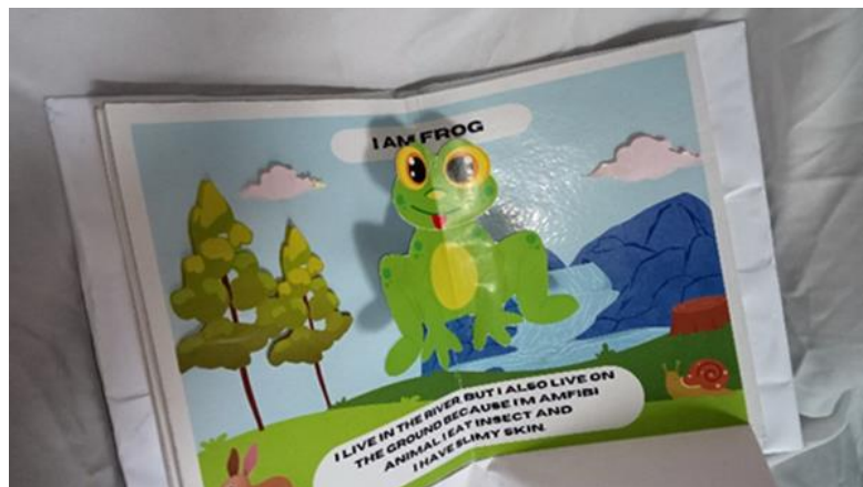
Figure 9. The Description Text of “FROG”