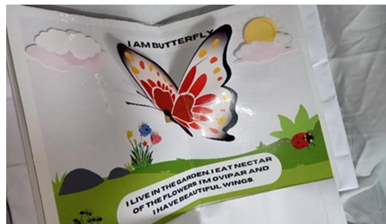
Figure 7. The Description Text of "BUTTERFLY"