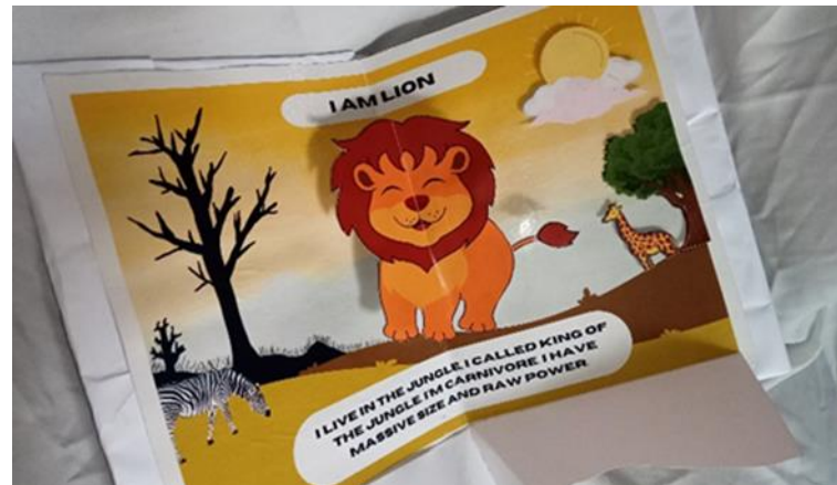
Figure 3. The Description Text of "LION"