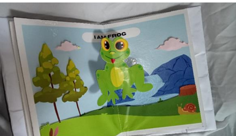
Figure 8. The Display of Page 4 “FROG”