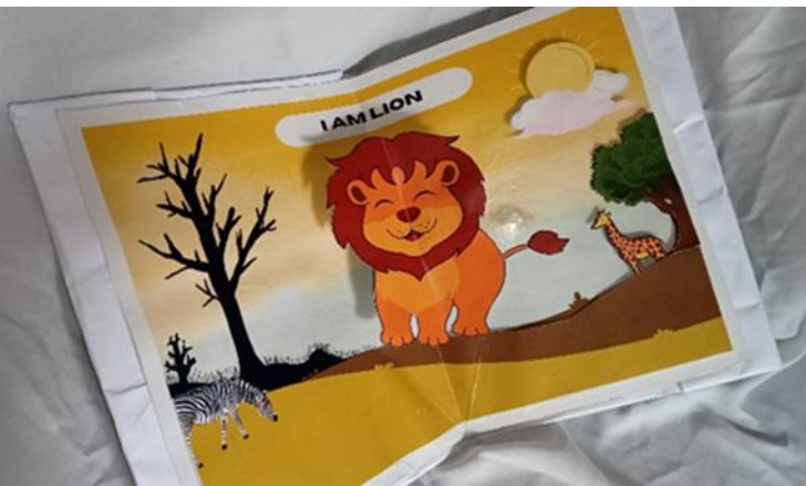
Figure 2. The Display of Page 1 "LION"