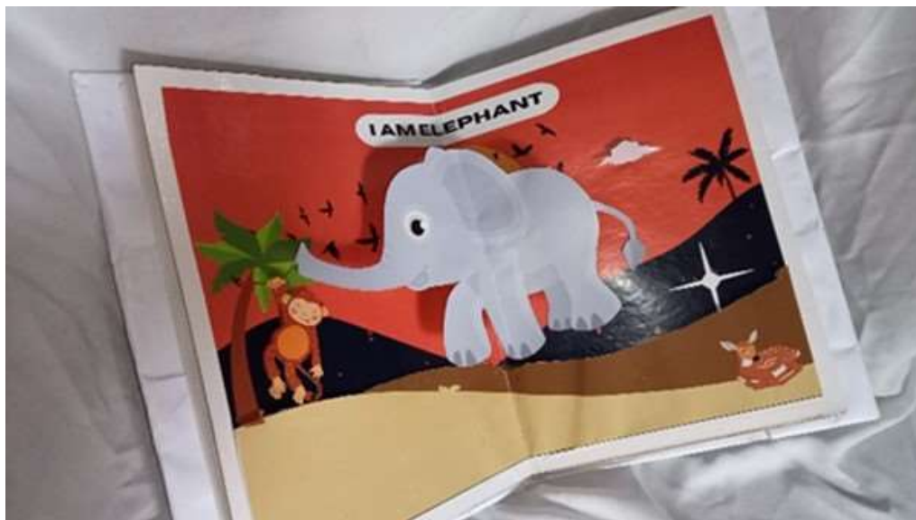
Figure 4. The Display of Page 1 “ELEPHANT”