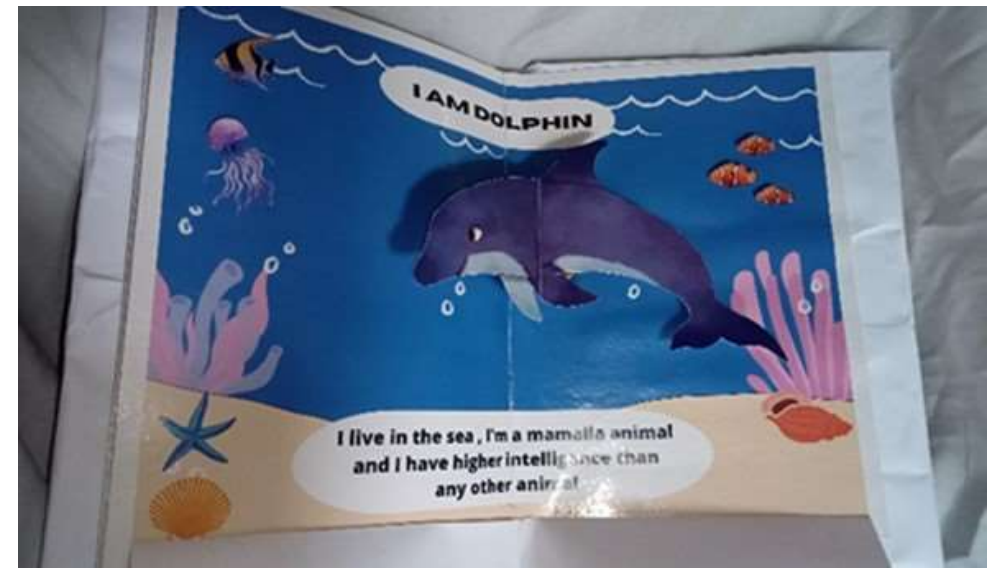
Figure 11. The Description Text of “DOLPHIN”