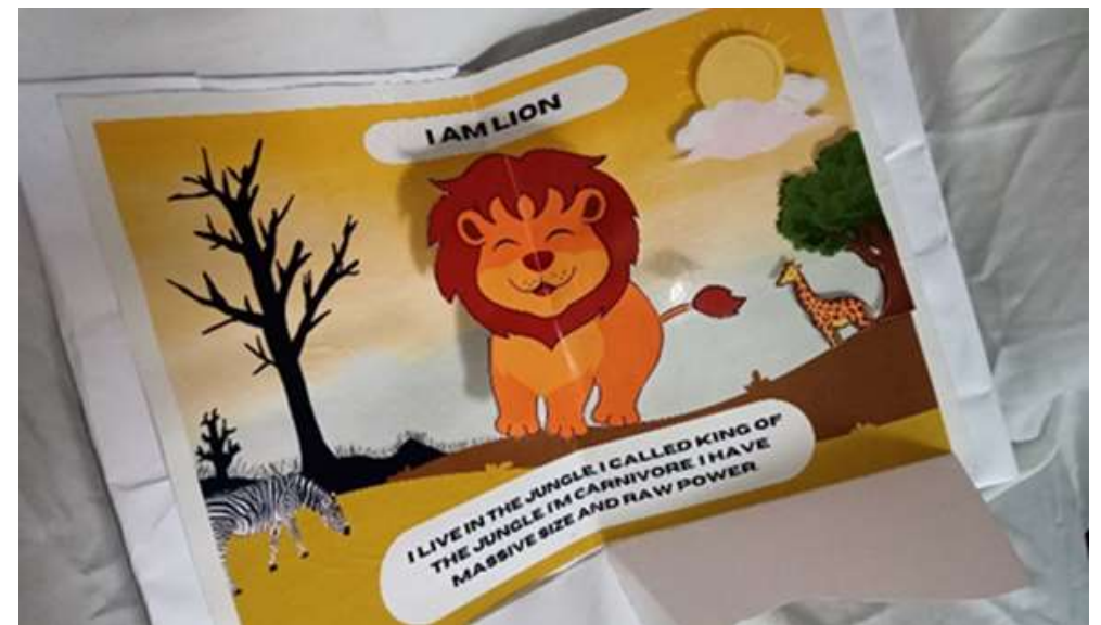
Figure 3. The Description Text of “LION