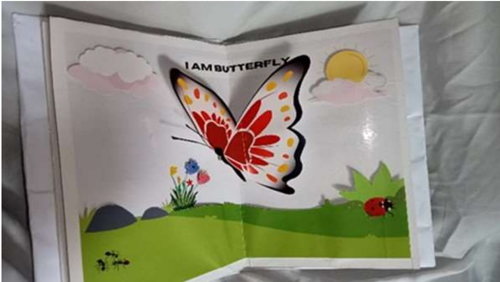
Figure 6. The Display of Page 1 “BUTTERFLY”