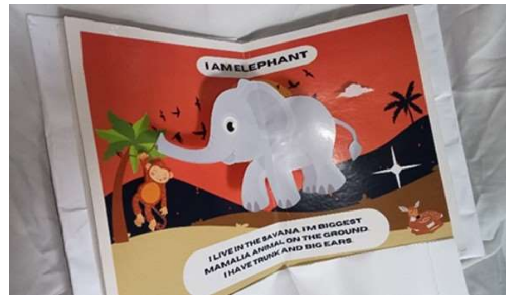
Figure 5. The Description Text of “ELEPHANT”