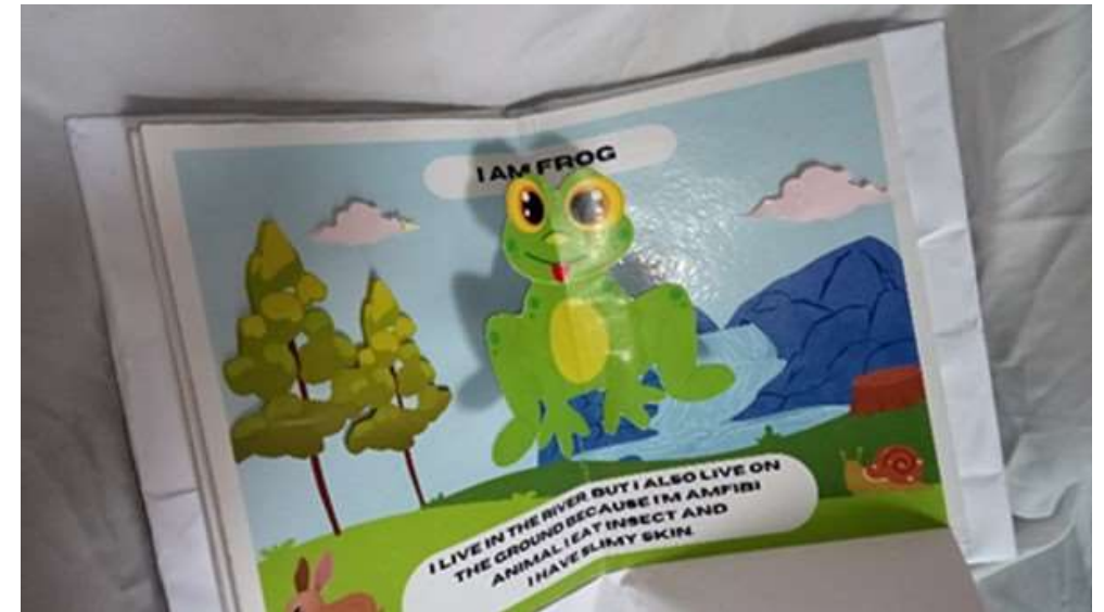
Figure 9. The Description Text of “FROG”