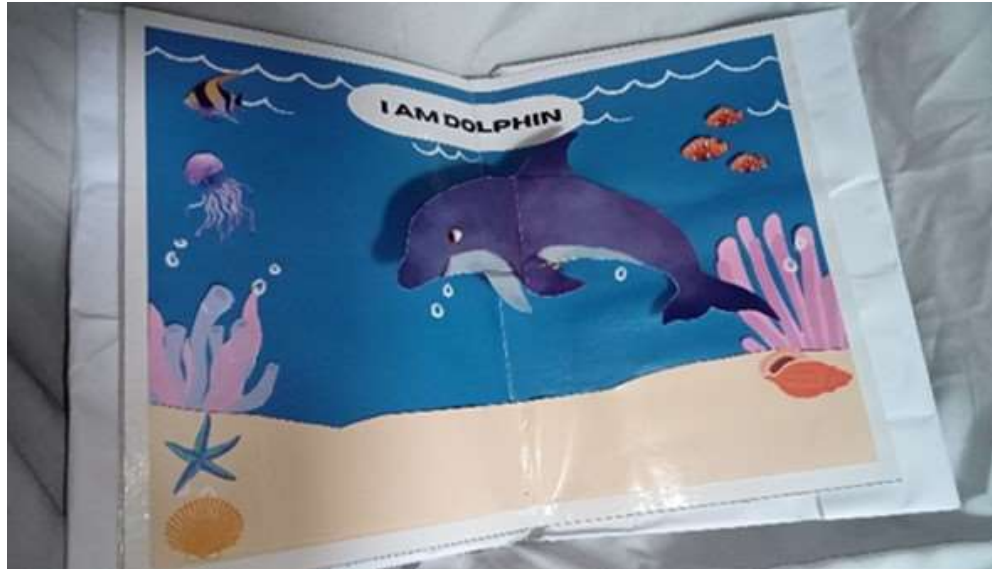
Figure 10. The Display of Page 1 “DOLPHIN”