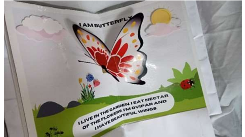
Figure 7. The Description Text of “BUTTERFLY”