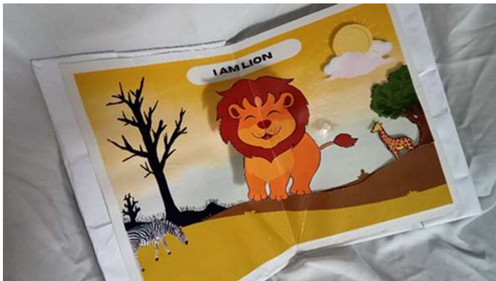
Figure 2. The Display of Page 1 “LION”