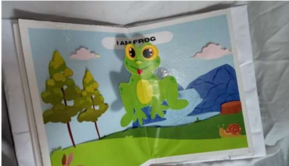
Figure 8. The Display of Page 1 “FROG”