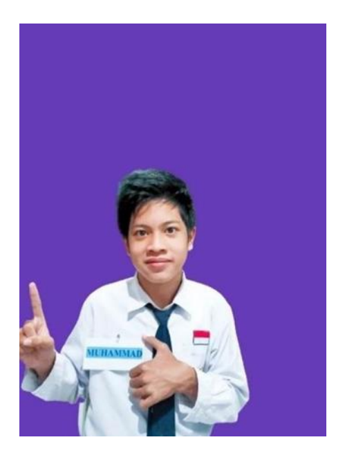
Figure 1. Example of Instagram photograph in bio poem strategy

This is an illustration of the instagram photograph in bio poem strategy. It consists of several steps, including: