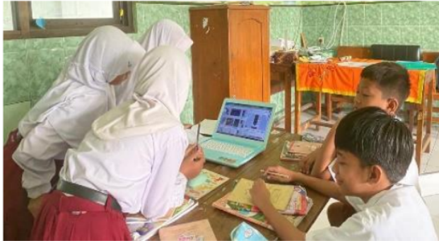
Figure 1. Designing Product Planning

electronic media. After finding the designs, the students were asked to write down the materials and steps on the provided worksheet. Then, the students designed the water purifier device and sketched the design.