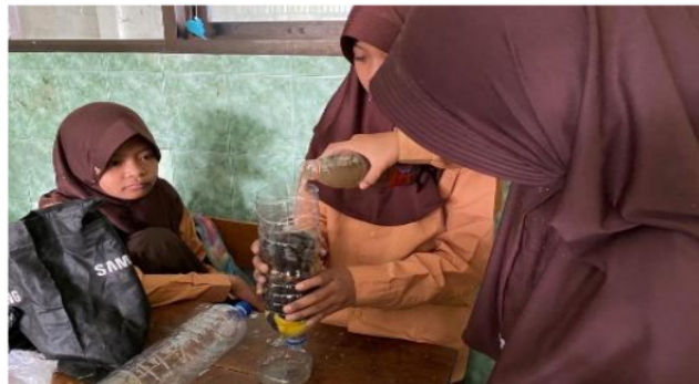
Figure 2. Product Trials

On the second day of learning, the teacher monitored the progress of the water filter tool project, asking about the progress of the project starting from the materials that had been brought. Then, the teacher guided the students to start conducting experiments. The students started by cutting and arranging the materials from the sketch made the day before. After the arrangement of the water filter tool materials was completed, the students then conducted an experiment by pouring murky water into the water filter tool.